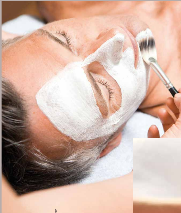
- FACE -