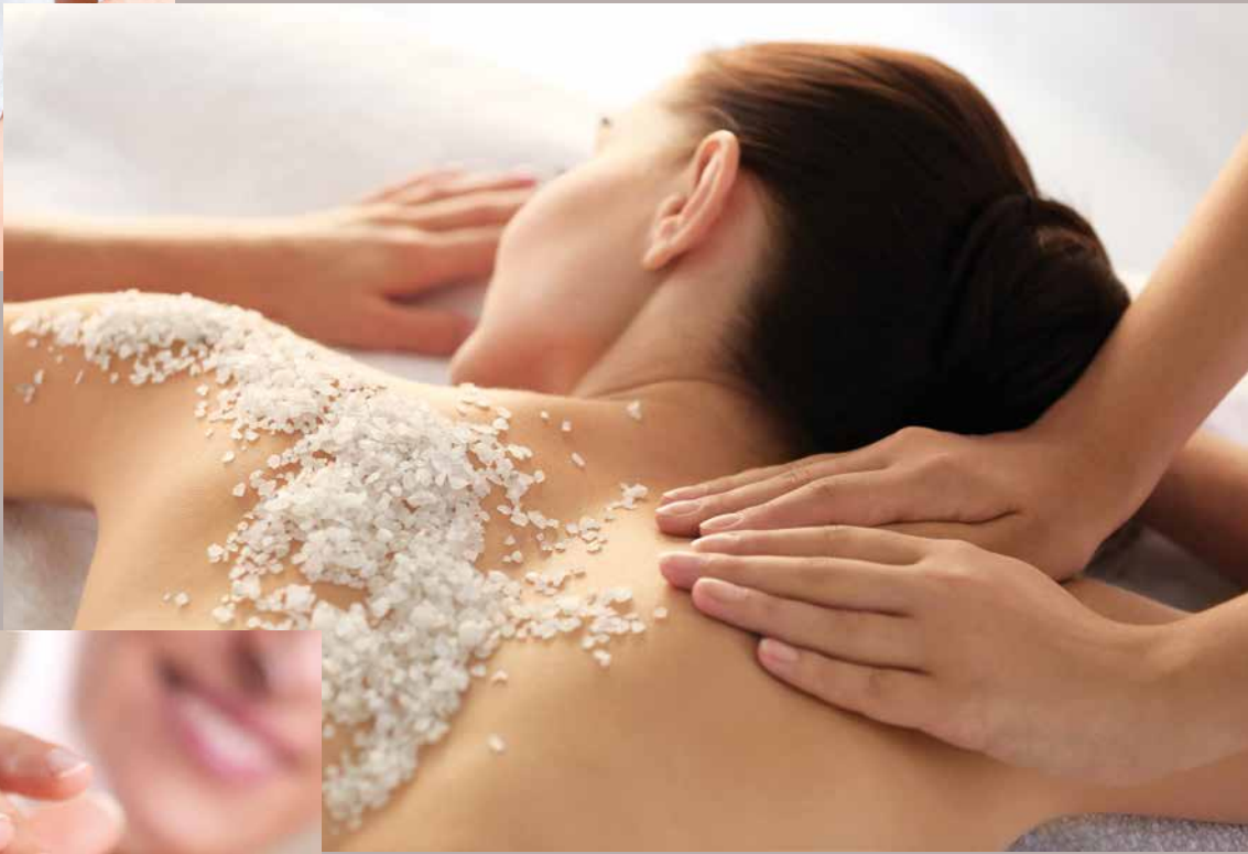
- BODY -