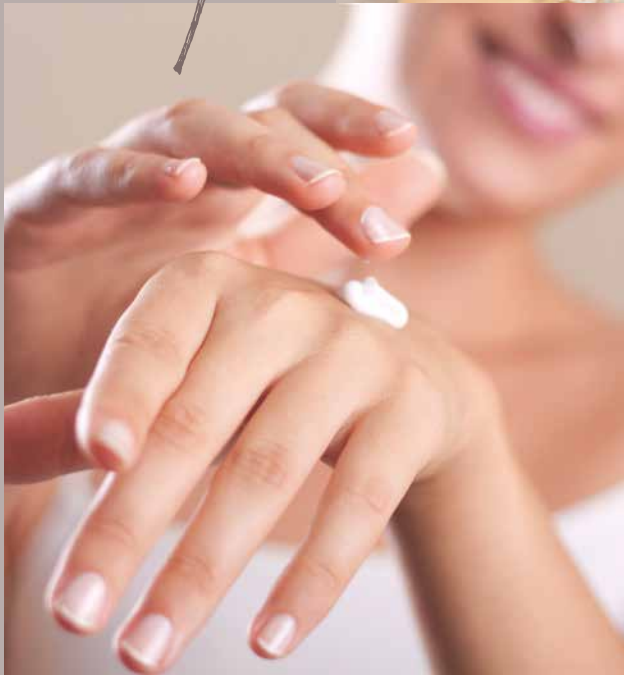
- HANDS & FEET -