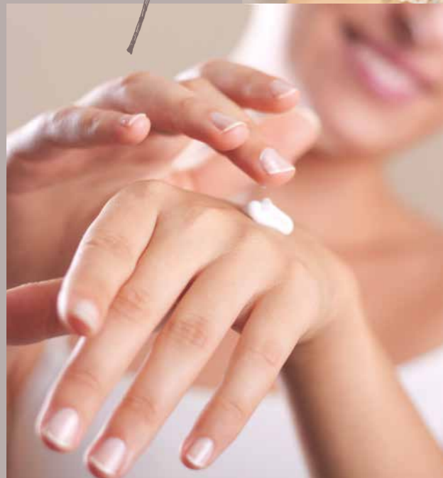
- HANDS & FEET -